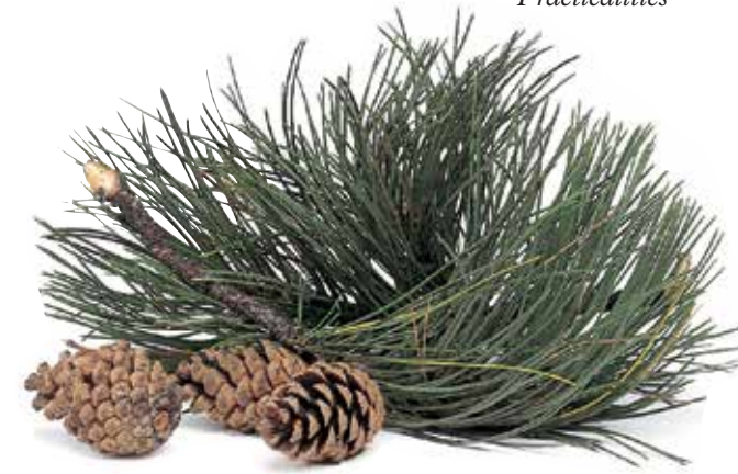
Pine, a powerful respiratory antiseptic and decongestant, also revives and refreshes

An interest in the chemistry of essential oils can be a very useful basis for understanding both the likely properties of an essential oil and any